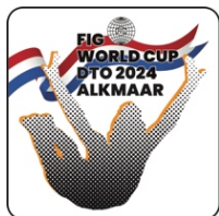
FIG World Cup DTO 2024, Alkmaar Additional training facilities March 15/20, 2024